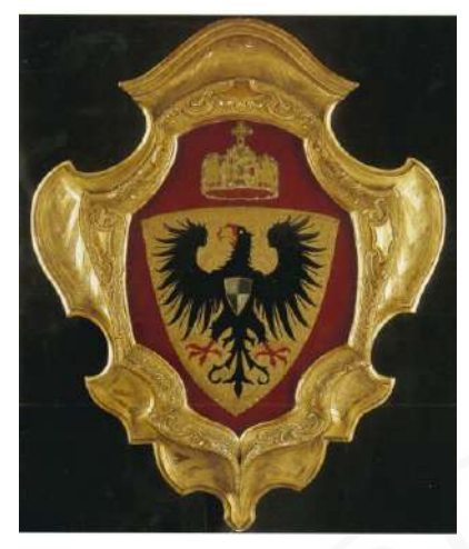
Figure 2: First coat of arms of the German Empire (Collection Stiftung Preußische Schlösser und Gärten Berlin-Brandenburg, Inventar-No. SPSG, IX 7696)

distinctly Catholic character. The same concerned the double-headed eagle of the "Holy Roman Empire of German Nations", whose 2 heads should probably symbolize the "German lands" and "Rome".