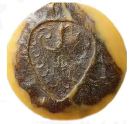
Figure 1: Back of the Zähringer seal with the illustrated imperial eagle. This belonged to Berthold V. von Zähringen and dates from 1219. He was the son of Berthold IV of Zähringen

However, heraldic evidence for the use of the eagle as an imperial heraldic animal in German lands can be traced only as far back as the 12th century. Probably the oldest known German imperial seal with an eagle is from 1157 AD and belonged to Duke Berthold IV of Zähringen, one of the most influential dukes in Swabia (Figure 1). The use of the eagle in the seal was intended to reflect the duke's high position in the empire.