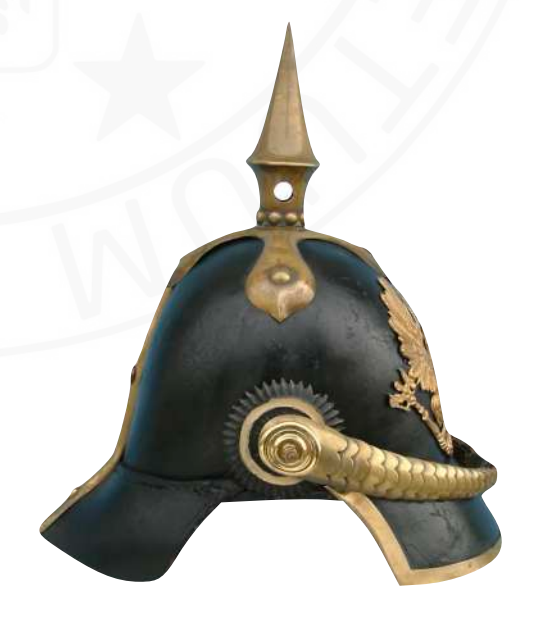
Fig. 2 (M42 Helmet Sideview)

As well known, the shako has been usually worn in the Prussian army before the spiked helmet was introduced. Although this headgear was dressy, it