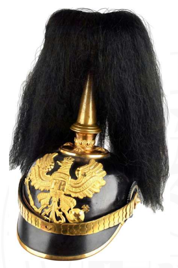
Fig. 8: Officer's helmet with hair plume (private Collection)

helmet of the W. Jäger company in 1841 (SEE AGAIN THE TRANSCRIPTS FIG. 4 + 5). The rest of the desired properties of a soldier's helmet that I have listed come from articles in specialist journals of the time. 5